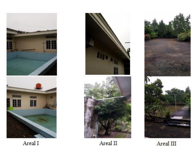
Figure 1. Three rainwater harvesting areas in the rainwater harvesting house.

The study was conducted in a premise and its yard owned a person was known as rainfall harvesting house from January and March 2023. The materials used was the rainfall facilities that were available in the premise namely fishpond, swimming pool, infiltration wells, glass measuring, bucket, plastic bags, measuring device etc. Rain was measured in each area of rainfall harvesting sites namely rainfall that fallen into the swimming pool, fish pond, rainfall tank, and infiltration wells. Data collected from the observation in each rainfall harvesting areas was predicted and observed.